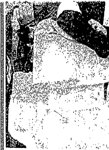
We backo Jacko... fans in London yesterday

Kroll is largely staffed by former CIA officers. One writer said: "If you want someone to dig up the dirt, they are the people." Pepsi denied the probe.