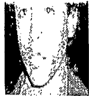
Jordy... 'abused by star'

"It is true he tried to reach an out-of-court