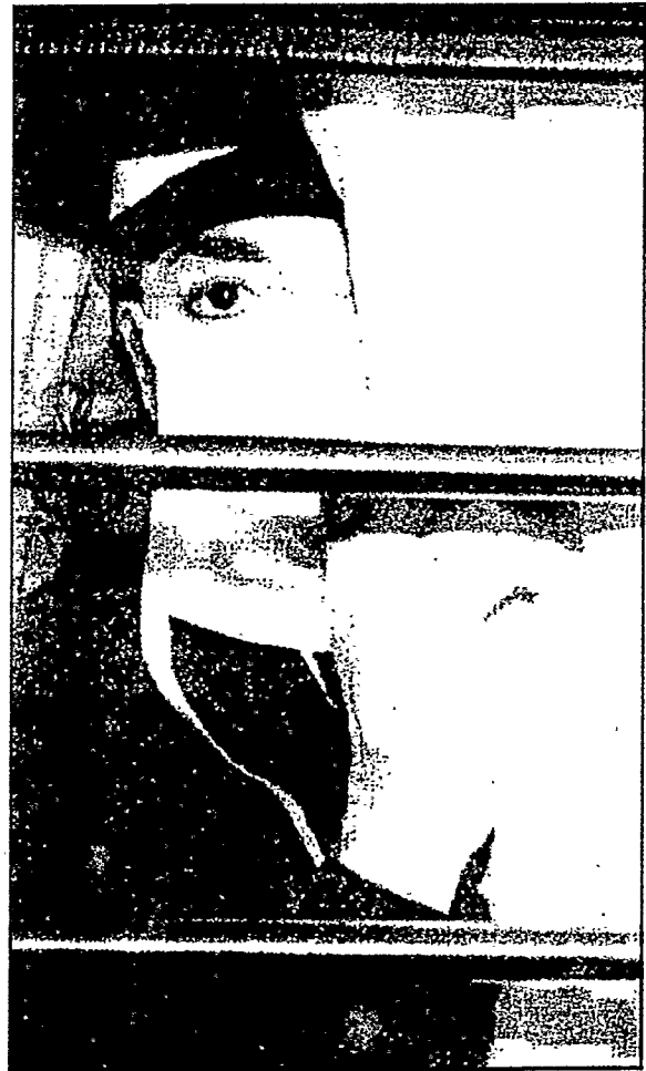
Masked . . . Jacko peers from van on way to show yesterday